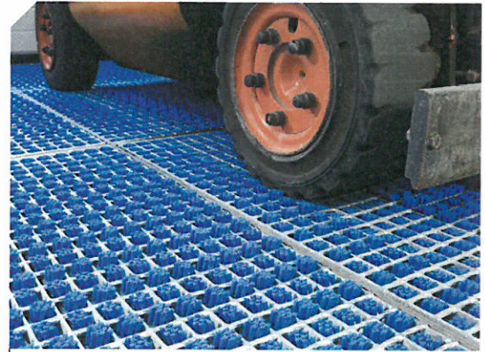
The ProfilGate foreign matter capturing system

Once installed, the system requires foreign matter collected in the tray to be removed once a month. This can dramatically reduce ongoing cleaning costs. Pedestrians and vehicles move over Profilgate without any loss in productivity and up to 90 per cent of the transported dirt will be removed. Heute offers a lifetime warranty on the trays and grates. The ProfilGate System is also available in an aqua version where it not only cleans tyres and shoes but sanitises them as well.